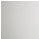
OP71 matt white